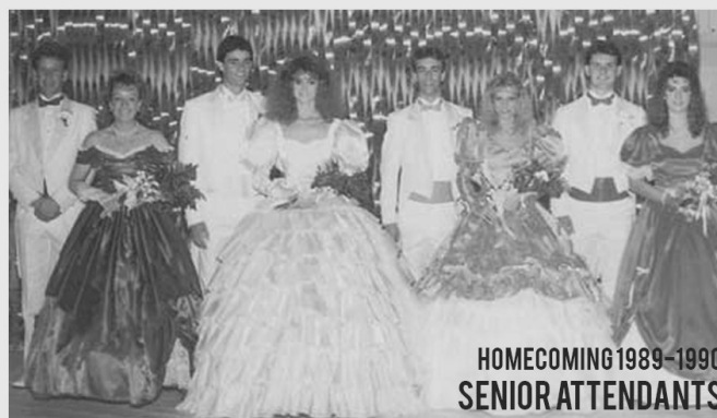
Homecoming 1989-1990 SENIOR ATTENDANTS

Woodlawn High School is celebrating 100 YEARS in 2020! Each month during this school year, we will share a memory from the past 100 years. Check out the complete VIRTUAL YEARBOOK online at woodlawnschools.org